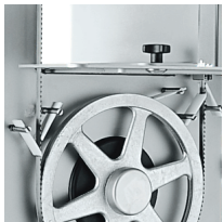
Alimentary plastic blade scraper in quick to insert. Watertight black plastic flange to protect the